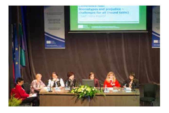
Today, the European institutions are committed

to right historical injustice against the Roma and stimulate their inclusion into society. In this regard, international documents and legal acts were adopted, condemning racism, intolerance, and hostility towards the Roma community. Cultural diversity and pluralism are part of a common vision of modern societies, which are based on respecting human rights, ethnic identity and personal dignity of each individual. Unfortunately, in reality we are facing intolerance, hostility and refusal of the different. Above all, such occurrences are enhanced in times of crisis, e.g. mass influx refugees into Europe. Intolerance is expressed in public discourse as well