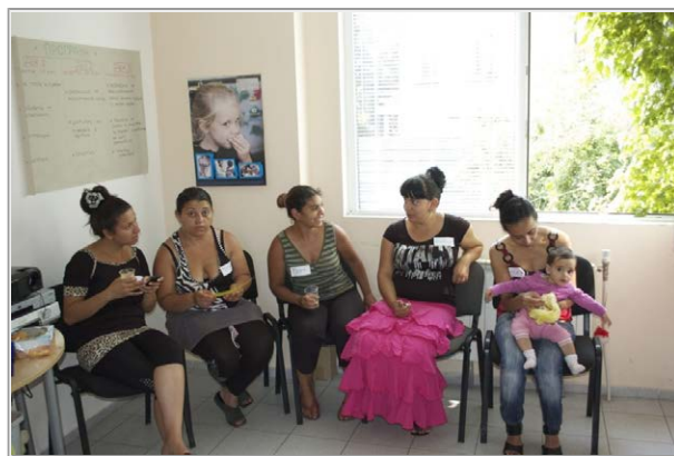
Photo: Mothers that are visiting our parenting courses and would appreciate participating in the Financial management training.

basic needs of their families. The unemployment is quite high, the educational level is low and families have low income. The instable and insecure incomes result in lack of ability for financial management of the family budget. That is why creating a good training course for financial management is an important task to support the development of Roma community in our country.